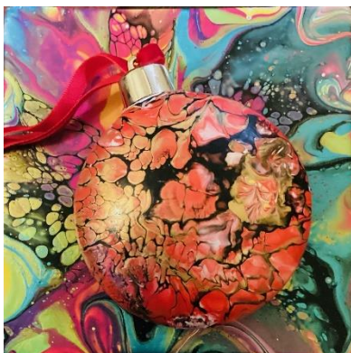
Bobble and tile (left) By Linda Lambert Acrylic pour

CALLING ALL MEMBERS! Please share your Creations by sending photos of your art with title/medium to... gALLERY@caterhamartgroup.org.uk