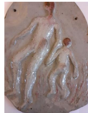
(Above) Moving On

I joined classes in painting and sculpture at Calat and, when these were unfortunately discontinued, went to Sutton College which I continue to do. My preferred medium is now ceramics.